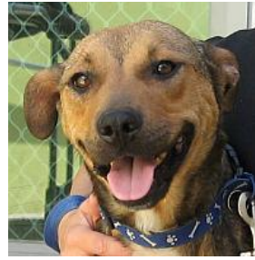
"Melissa" from Save A Dog

If you're interested in adopting a new pet or helping under privileged animals, please take a look at the websites of the organizations below: